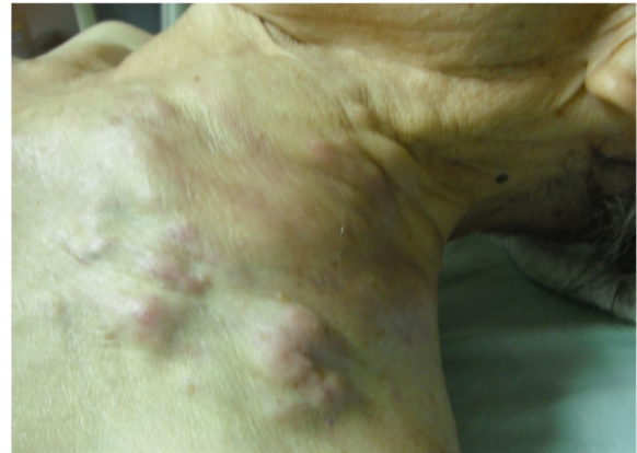
Fig. 1 A single tumor mass in the supraclavicular area

After admission, ADL decreased and the patient became bedridden because of his anticipatory anxiety for syncope onset. Subsequently, syncope episodes disappeared; however, the patients complained of prodromal symptoms such as dizziness, nausea, and ocular pain. These symptoms persisted for 20–30 min,